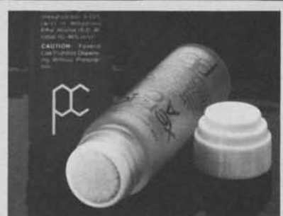
Special Dab-O-Matic™ Applicator Head